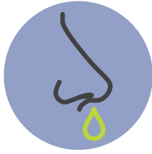
Runny or stuffy nose