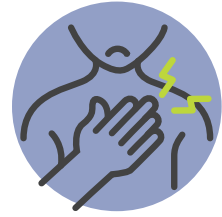
Mild to moderate chest discomfort