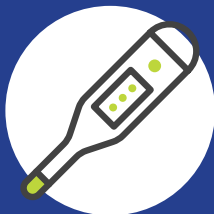
Fever or chills